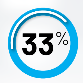
PRODUCTION EXECUTION MANAGEMENT

Which areas of manufacturing operations management software have been, or do you believe will be the MOST critical to success?