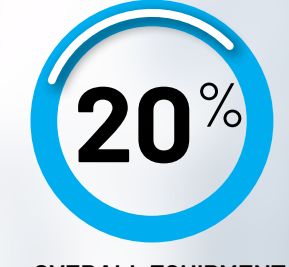
OVERALL EQUIPMENT EFFECTIVENESS