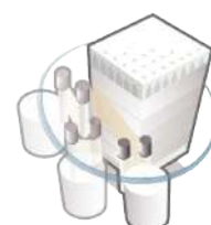
'PROACTIVE' CORNER COMPENSATION