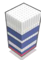
STRATEGIC FILM PLACEMENT