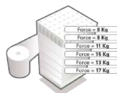
MULTI-LEVEL VARIABLE CONTAINMENT FORCE